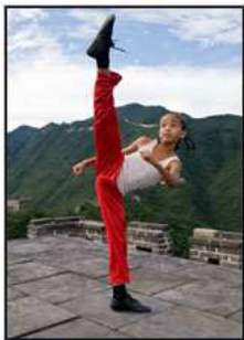
Jaden Smith stars in Karate Kid 2010

The original 1980's film, "The Karate Kid" starring Ralph Maccio as the student and Pat Morita as the venerable Karate Master has been remade! This time, in "Karate Kid 2010" starring Jaden Smith as the student and Jackie Chan as the master, the martial art that is actually learned is Kung Fu!