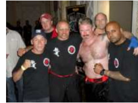
The home team!

A hard left hook sent his opponent crashing to the canvas within the 1 st minute of the first round! A subsequent left hook to the body sent his opponent to the canvas again just as the round was ending! Lucky him!