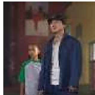
Jackie Chan co-stars as the boys Kung Fu Teacher